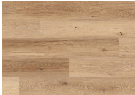
LI-DP05 Sun Valley