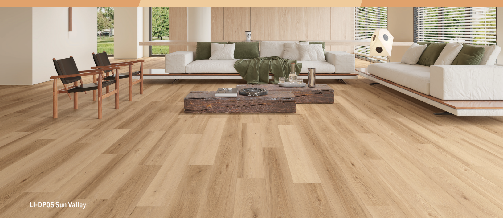
LI-DP05 Sun Valley

Lions Floor District Pro collection was created with exclusive patterns topped with intricate wood grain embossed surfaces to coordinate with various design options. Featuring a fiberglass-reinforced structure, the product delivers dimensional stability that yields high traffic tolerance. The District Pro collection is an embodiment of timeless aesthetics and performance-driven functionality.