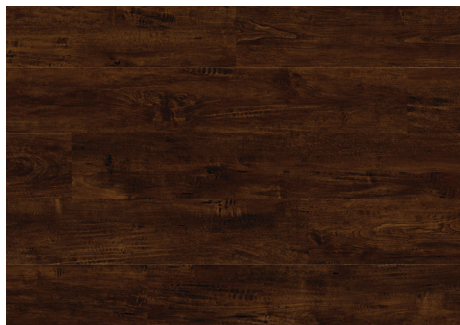
LI-DP08 Capitol Hill