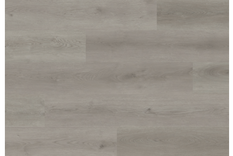
LI-DP03 West Chelsea